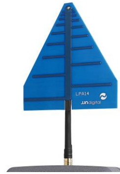
Directional High Frequency Antenna