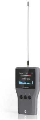
PRO-W10GX using Whip Antenna